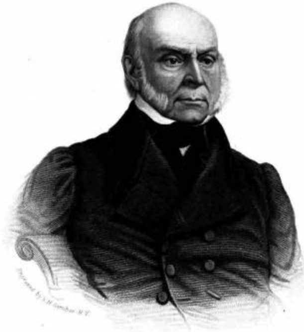
John Quincy Adams.